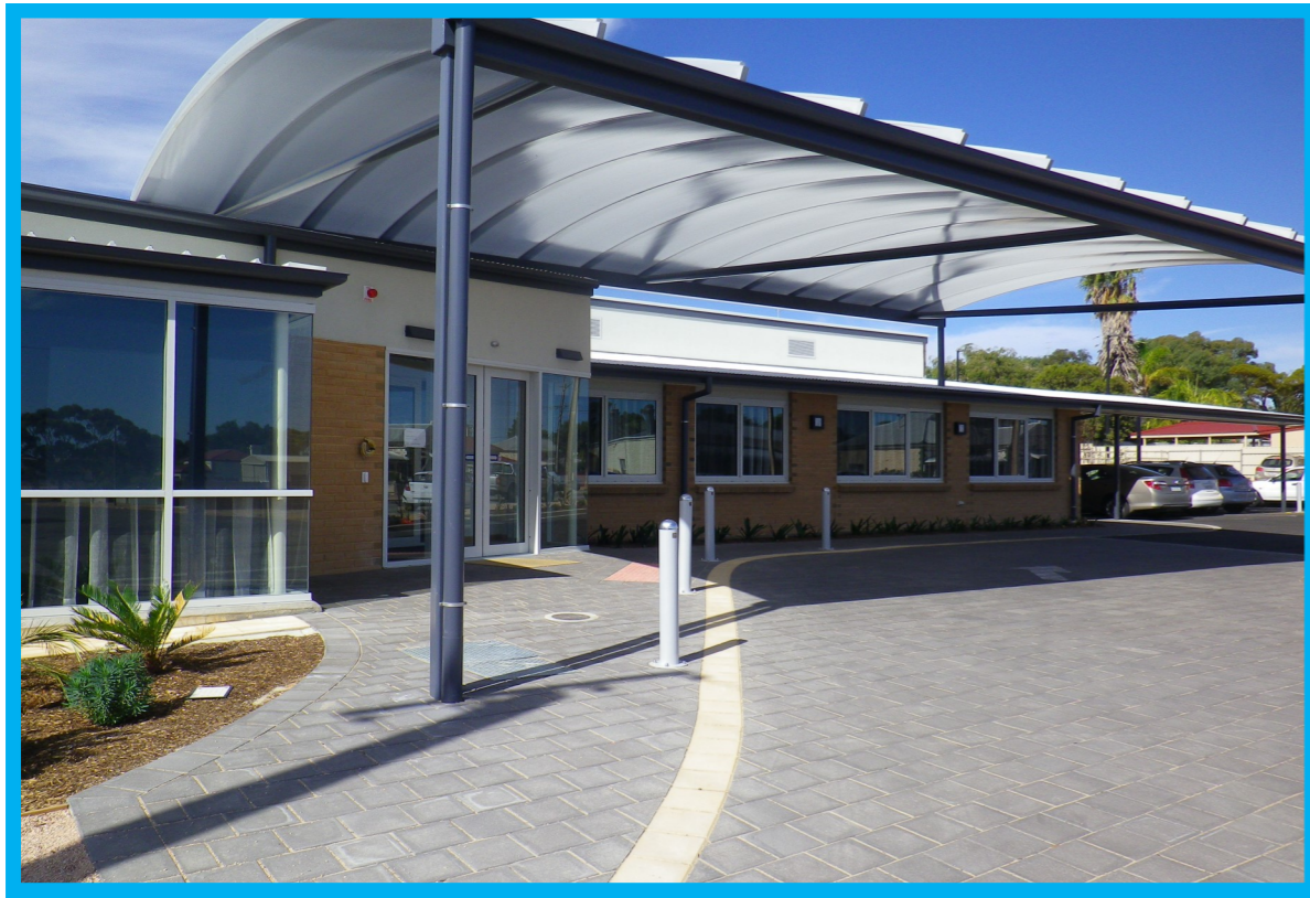
“Feedback” boxes are situated in Admin and Lounge areas throughout the Home.